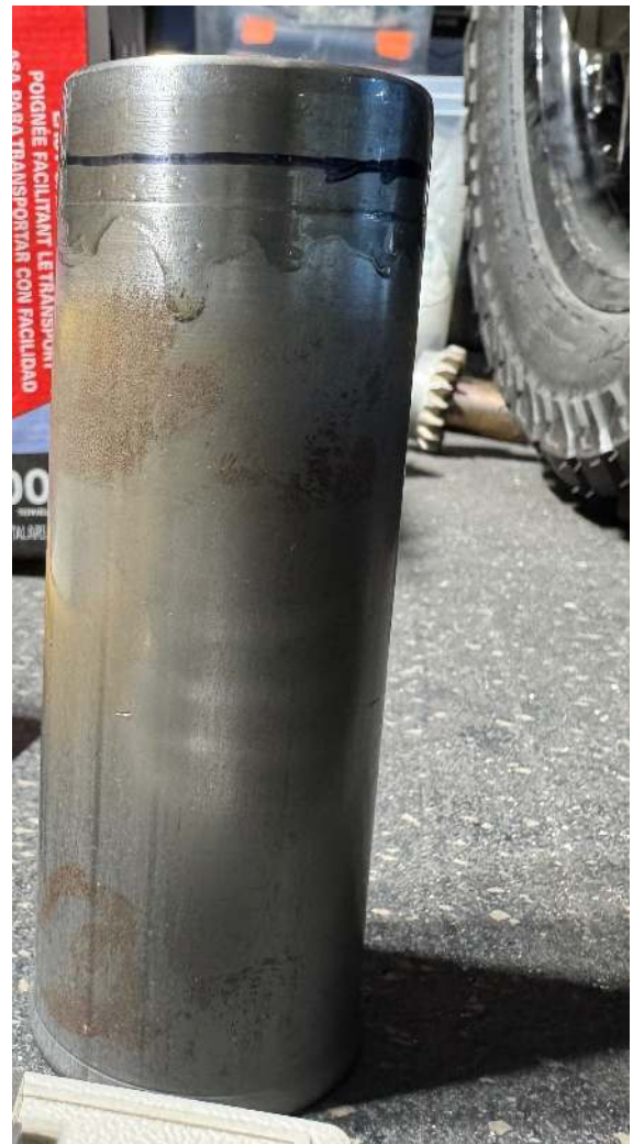
(d) Replacement canister distal end cleaned and