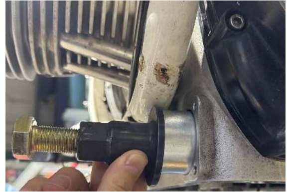
(f) Temporary axial driver assembled from available engine tools.