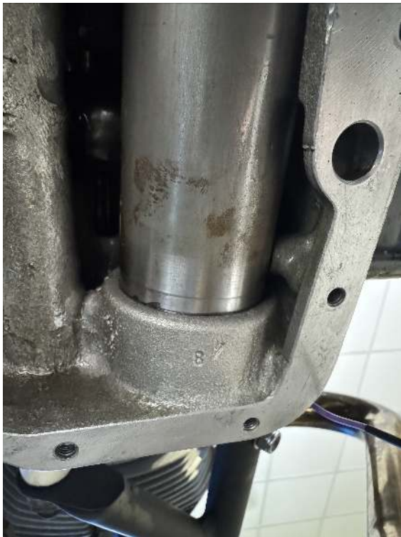
(g) Final installed position relative to the reference depth mark.