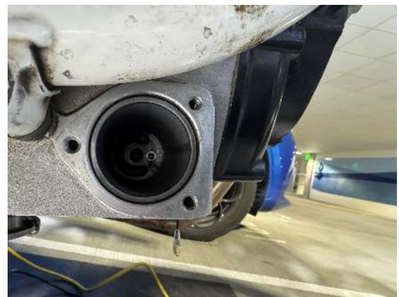
(h) View into installed canister showing improved concentricity and self-centering.