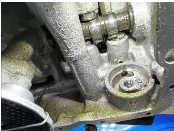
(c) Canister removed after controlled tapping se-