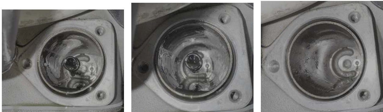
(a) Localized deformation identified (b) Fastener removed as first corrective action (c) Canister mechanically re-centered by controlled levering

The leak therefore arises not from global loss of O-ring preload, but from a change in load path and local support conditions that allow a radially initiated disturbance to manifest as axial seal extrusion.