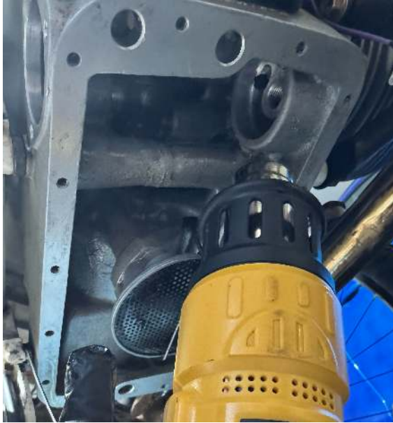
(e) Crankcase warmed with heat gun to reduce insertion force via differential expansion.