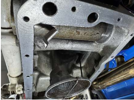
(a) Localized wall deformation during drive-out tapping. The bolt contact reaction at the canister wall was effectively radial prior to tapping. Plastic deformation and bolt rotation within the thin sheet are unavoidable.